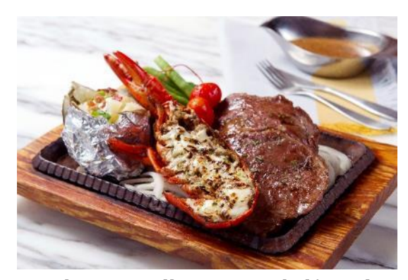
Lobster & Rib-eye Steak ($238)

The signature "Sizzling from the Grill" dishes at Made in HK are also applicable to the Buy-1-Get-1-Free discount! The hot iron plate with fresh ingredients and steaming sauce is simply satisfying! T-bone Steak (16oz)($188) is the big feast with both juicy tenderloin and flavourful