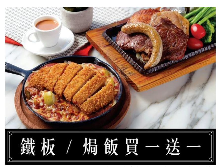
Buy-1-Get-1-Free discount for all "Sizzling from the Grill" and Baked Rice dishes

(Hong Kong, 26 October 2018) – Made in HK Restaurant has opened its second branch on the 8 <sup>th</sup> floor of Langham Place Mong Kok in August, bringing more local delicacies to all guests. To celebrate the first 2 months of success in Mong Kok, we are presenting a Buy-1-Get-1-Free Flash Offer at Langham Place branch to double the fun!