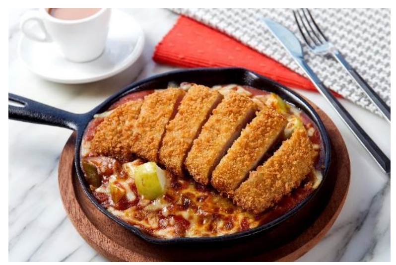
Tonkatsu Baked Rice with Tomato Sauce & Green Apple ($108)

"Baked Rice" is a staple Hong Kong style dish that the locals loved, which is even more tempting with the Buy-1-Get-1-Free offer! Tonkatsu Baked Rice with Tomato Sauce & Green Apple ($108) is the classic baked pork chop rice with a twist! The Japanese-style deep-fried pork cutlet and fresh green apple in the tomato sauce make it an appetizing treat. Baked Bolognese Rice with Steak Cube & Mushroom ($118) is the fulfilling combination of tender beef cubes, rich Bolognese sauce and mixed mushroom! Baked Seafood Rice ($138) includes various seafood and a hearty cream sauce for an ocean-sweet main course! Baked Chicken Curry Rice ($88) and Ox Tongue Baked Rice with Espagnole Sauce ($88) are also delectable choices!